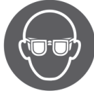
Wear eye protection