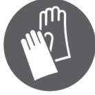
Wear protective gloves