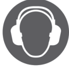
Wear ear protection