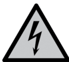
Electrical shock hazard