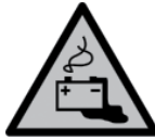
Warning! Battery Charging