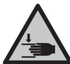
Warning crushing of hands