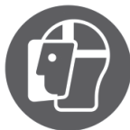
Wear a face shield