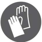
Wear protective gloves