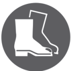
Wear protective footwear