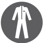
Wear protective clothing